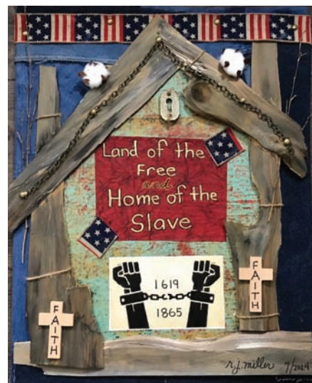
Home of the Slave