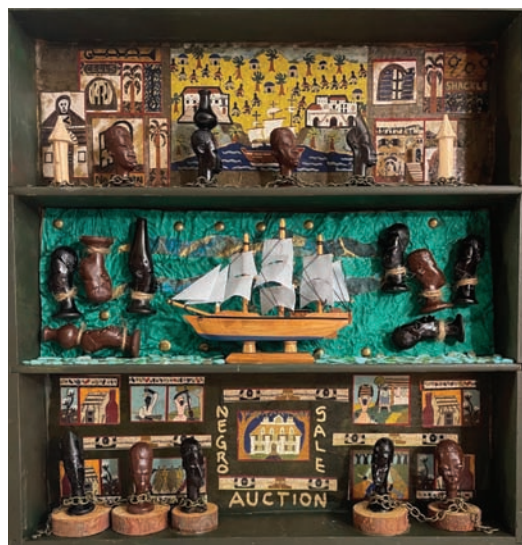
Coming to America

Artist & Exhibitions Specialist at Cotuit Center for the Arts